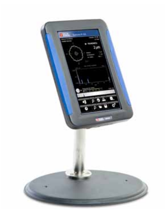
X-sight touch screen software

Speed and reliability matter; we choose Taylor Hobson metrology.