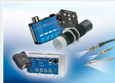
Colour recognition sensors, LED analyzers and colour online spectrometer