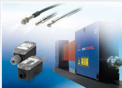
Optical micrometers, fibre optic sensors and fibre optics