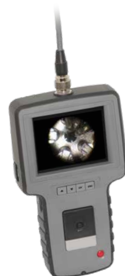
3,5" PVM video monitor (p.43)