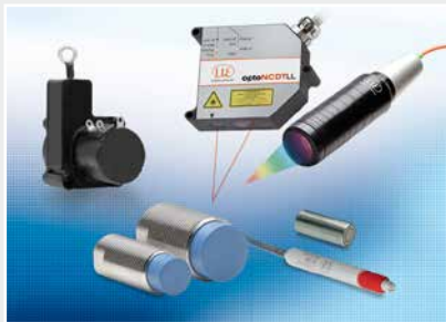
Sensors and systems for displacement and position