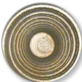
Inspecting screw threads