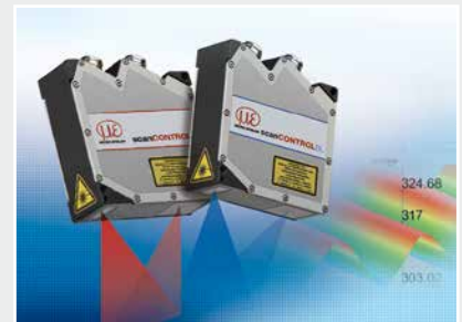
2D/3D profile sensors (laser scanner)