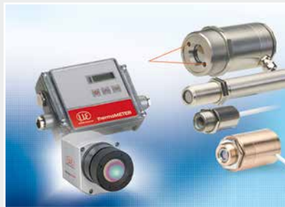
Sensors and measurement devices for non-contact temperature measurement