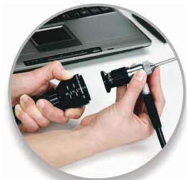
Connection to Ø 32mm eyepiece