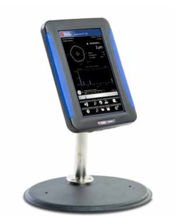
X-sight touch screen software

Speed and reliability matter; we choose Taylor Hobson metrology.