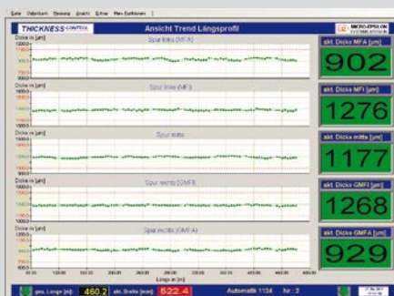
Longitudinal trend for 5 tracks TIP 8301.EO