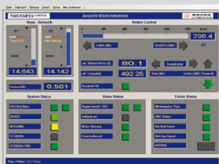
Set-up mode sensors and system control