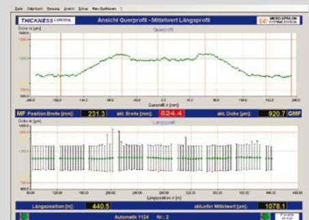
Combination profile TIP 8301.EO; vertical cursors show the points which are used for calender control

Optionally, the software can be enlarged by special features for thickness measurement of calenders or extruders.