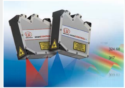
2D/3D profile sensors (laser scanner)