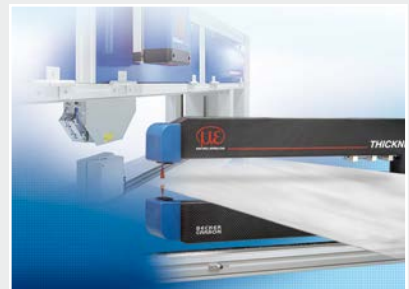
Measurement and inspection systems