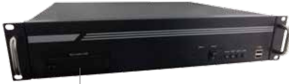
Optional front access - removeable 2.5" Drive Bay