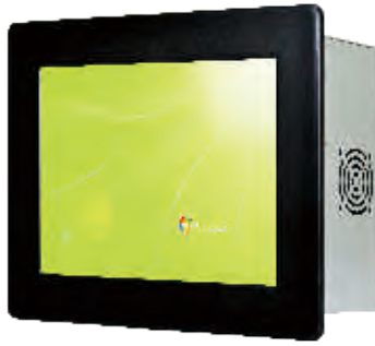
Panel Mount(6 mm front bezel) PCI Input