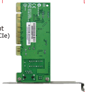
PCI Input (Optional PCIe)