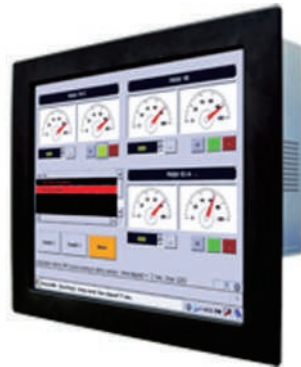
Panel Mount(8 mm front bezel)