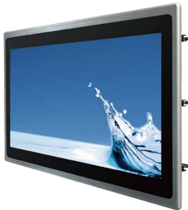
Real Flat Panel Mount (IP65 front side)