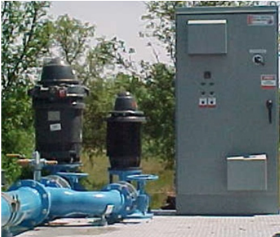
Outdoor NEMA 3R multiplex pump solution

Unidrive M400 pump control systems include the multiplex pump solution pre-programmed with pump control software and parameters to significantly reduce costs through measurable improvement in pumping reliability, up-time and performance.