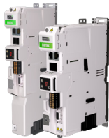
Digitax HD Servo Drives