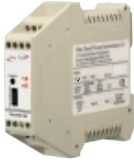
Data Acquisition and Signal Conditioner with Universal Input