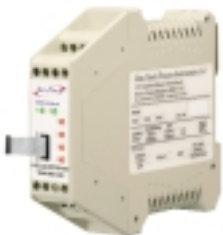
Logic Expansion Module