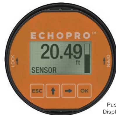
Push Button Display Module