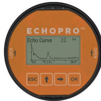
Echo Signal Return Curve