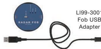
LI99-3001 Fob USB Adapter