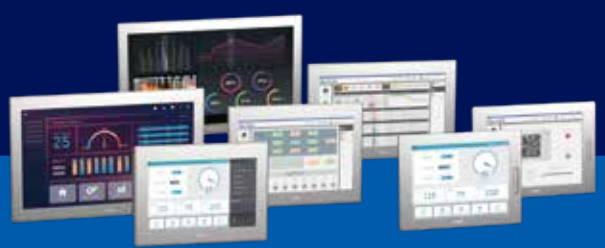
Industrial Flat Panel Monitors FP6000 Series

Industrial Flat Panel Monitors FP6000 Series adapt with various host devices that you need, with a high-quality and stylish design display and high robustness. FP6000 Series fits the most suitable place for machine operation by installing separately to improve your machine's operativity.