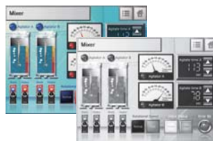
Support for Monochrome Display